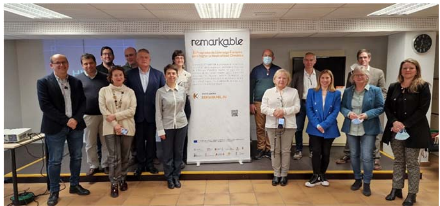
National focus group workshop. Valladolid (Spain)

private and business sectors, civil society and the community education and select the sectors with the highest incidence in each municipality.