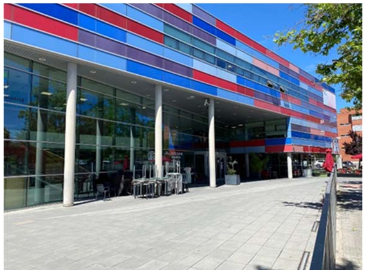
Building where the Energy Transition Office is located

With the support of citizens Rivas Vaciamadrid is moving forward to achieve the goals of energy transition and climate neutrality set out in the national and European strategies.