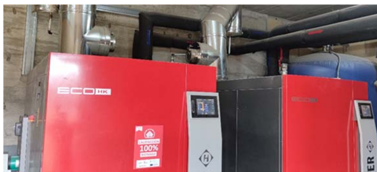
REPLACE biomass boiler label

The 4th Call is open with a deadline until 09/30/2022. https://www.eucityfacility.eu/calls/4th-call.html