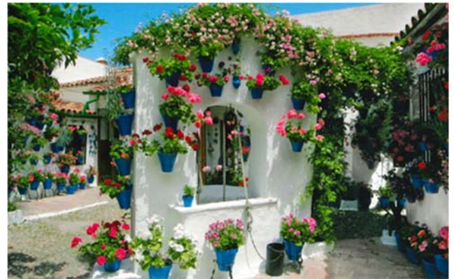
..... with a Spanish detail

Considering this "background" we offer our experience to develop new initiatives in the energy transition and climate change mitiga-