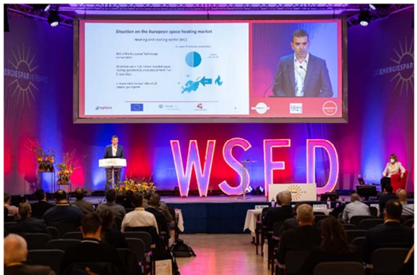
Presentation in Wels, Austria

Later on, we carried out "The Wrap-up and recommendations" of the conference on buildings and innovative technologies within the framework of the European project REPLACE, in which the EREN of Castilla y León also participates.